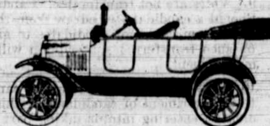
Henry Ford's 1923 Masterpiece, to Be Given as Third Prize