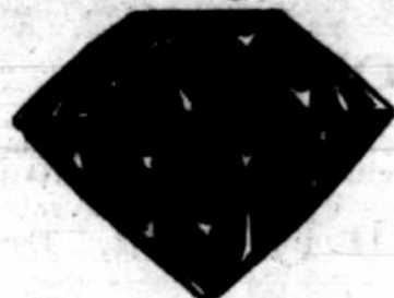
$200 Diamond Ring, Fourth Prize

SOLITAIRE DIAMOND RING Show us the man or woman, boy or girl who would not like to possess such a jewel and we will show you one who has absolutely no sense of the beautiful. You must see it in order to appreciate it! Purchased from and on exhibition at M. L. Smith, Jeweler, 198 Broadway, Portland, Oregon.