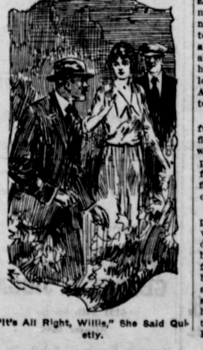
"It's All Right, Willis," She Said Quietly.

The Columbian Press, Inc. LOBBY RAILWAY EXCHANGE BUILDING PRINTERS—PUBLISHERS—LINO-TYPERS BROADWAY 2242 (Continued Next Week.)