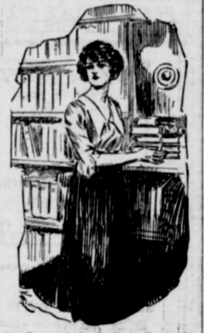
She Removed the Books in Front of a Wall Safe to the Right of the Door.

fon hurried ahead, he went almost noiselessly. She stood still, shivering a little now in the cold; and she listened, she no longer heard his footsteps. What she had done was done; then just as she was telling herself that it must be many moments before she would know whether he was coming back, she heard him returning; at some little distance, he spoke her name so as not to frighten her. She knew at once it was he, but a change in the tone surprised her. She stepped forward to meet him. "You found your friend?" "Yes." "What did he tell you? I mean what is wrong that you did not expect?" "She heard his breath come fast. 'Nothing,' he denied. 'No; you must tell me! Can't you trust me?'" "Trust you!" he cried. He turned to her and seized her hands. "You ask me to—trust you?" "Yes; I've trusted you. Can't you