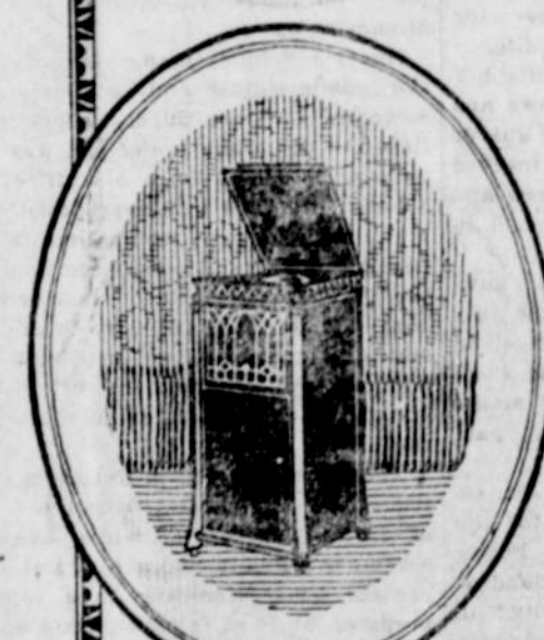
The lights flashed on. Case was gone. Her voice was coming from the New Edison.