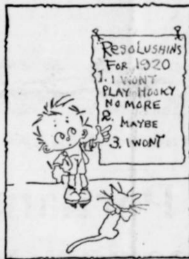
"That second resolution may come in handy to save my conscience!"