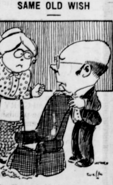
Mrs. Henpeck (during the quarrel)— Oh! I wish I had been born a man. Mr. Henpeck—So do I.