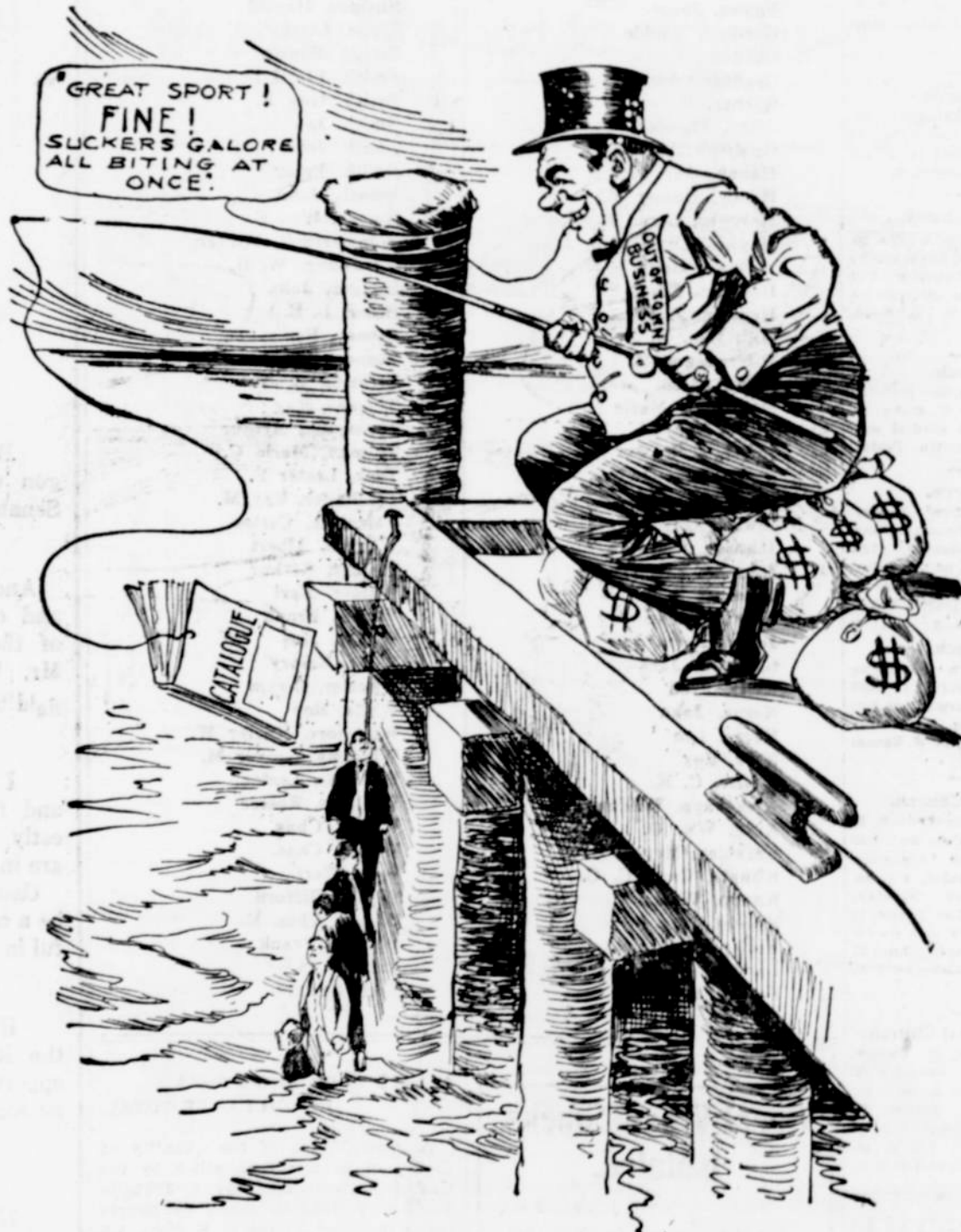
THE CATALOGUE BAIT

Last year in Fresno County, California, there were orders for over one hundred windmills sent to one mail order house alone. In case the man who bought "long distance" had to pay the freight, haul the windmill out to his place and stand the expense of erecting it—when, if he had been wise, he could have bought the same, identical windmill at his local dealer's for the same money, could have had it taken to his place and erected without cost or trouble and without the freight from Chicago to Fresno tacked on. "Fishing for suckers" may be good sport—for the other fellow—but it's hard on the suckers. Let us shun this "out-of-town" bait religiously.