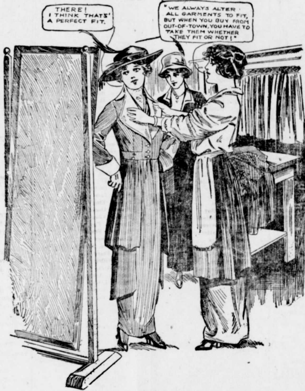
THE RIGHT WAY.

The secret of success in shopping lies in being able to look at the garment before you pay for it. You not only look at it. You try it on. You have the chance to try on several. If one does not suit, another will. If alterations are needed, the fitting can be done on the spot. There may be other ways to shop. But this is the only right way. This is the "trade-at-home" way. And it brings not only success to you, but adds prosperity to your town as well. Every purchase you make in this way creates a permanent value in your community, apart from the value and pleasure you get out of it. And you become a community builder. Then why shop any other way? Keep this picture in mind and you will not fail in your duty to yourself and your town.