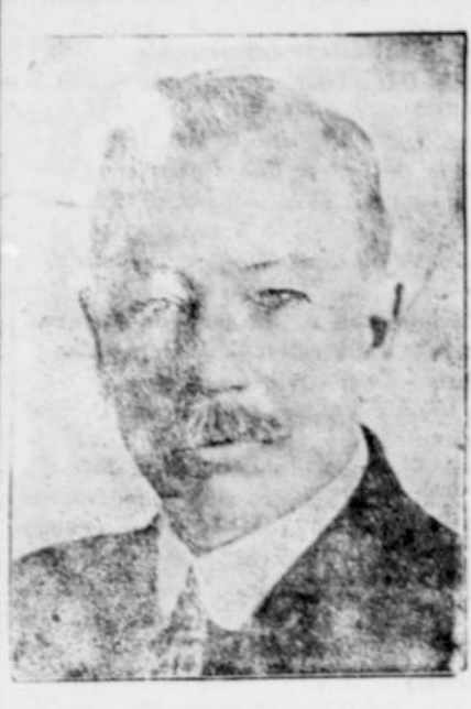
Republican Candidate for the Nomination for Circuit Judge DEPARTMENT NO. 6

not look a light thing with us to 28 years in Portland. I shall at all times commit perjury, or even sub- give patriotic, impartial and undivided attention to duty. Paid Adv.