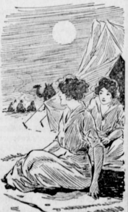
At Night They Sat Out in the Moonlight.

In Scandinavia the peasant women who worked all day in the fields, have had their freeless methods of cooking for a long time. While breakfast was cooking, the pot containing the stew for dinner was brought to a boil then placed inside a second pot, and the whole snugly ensconced between the feather beds, still warm from the night's occupancy. Some of these women had a loosened hearthstone and a hole beneath.