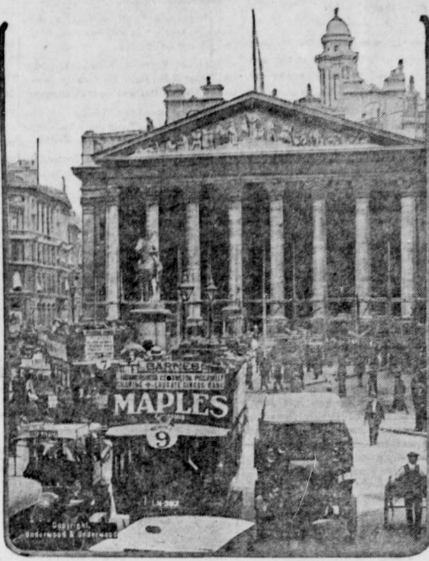
ROYAL EXCHANGE, LONDON