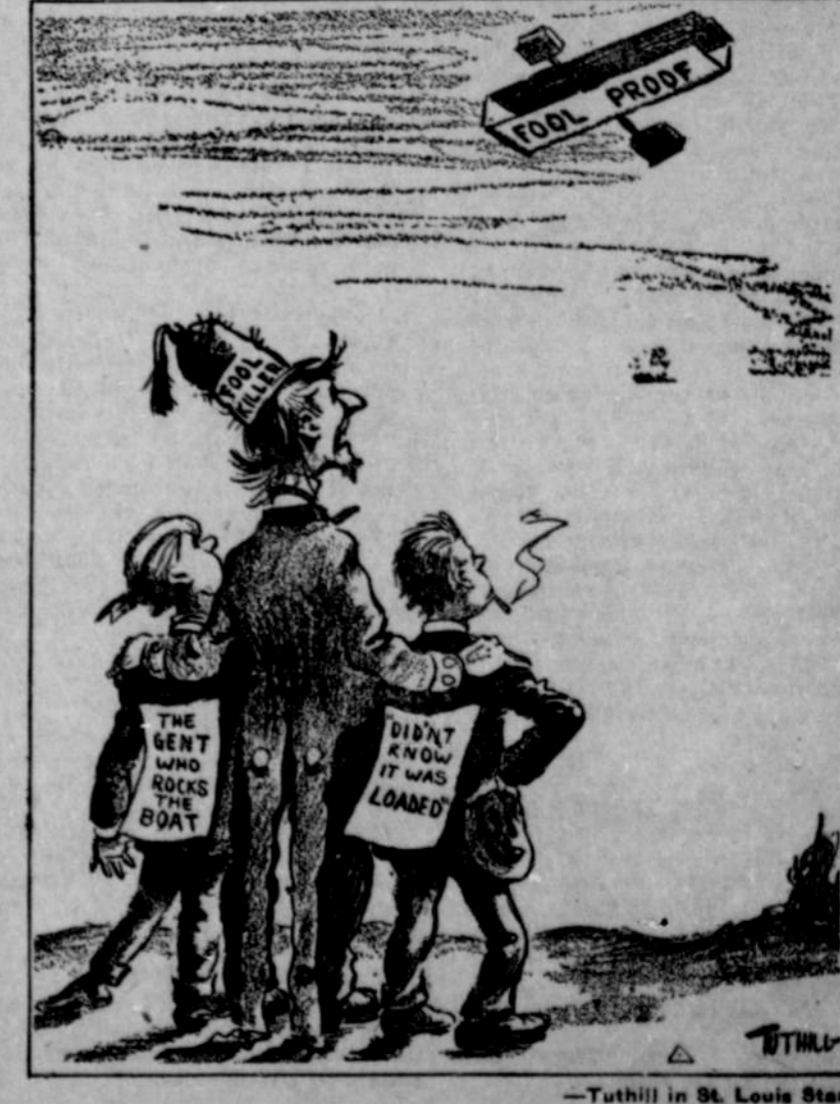
—Tuthill in St. Louis Star.