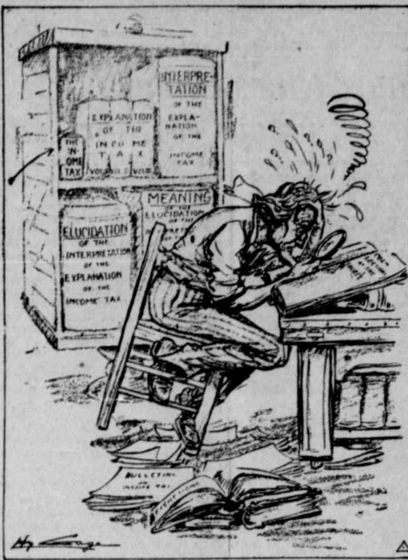
—Gage in Philadelphia Press.