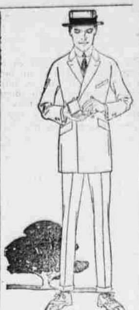
The Scotch Woolen Mills

GARDEN and FIELD SEEDS Sudan Grass, Alfalfa Seed, Red Clover, Sweet Clover, Baart Wheat, Treby Barley, Blue Grass, Field Corn, and a full line of Vegetable Seeds.