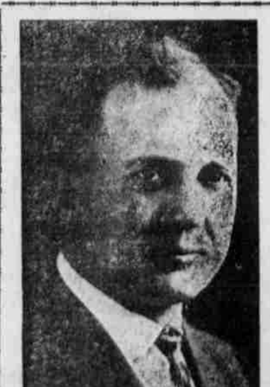
ROBERT STANFIELD Republican Candidate For United States Senator