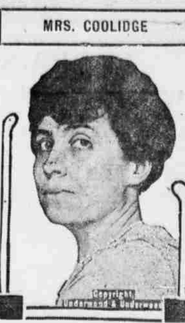
Mrs. Calvin Coolidge, wife of Gov. Coolidge, the Republican candidate for vice-president.

"Villain." This word has come down to us from Latin through the French and means a very wicked person.