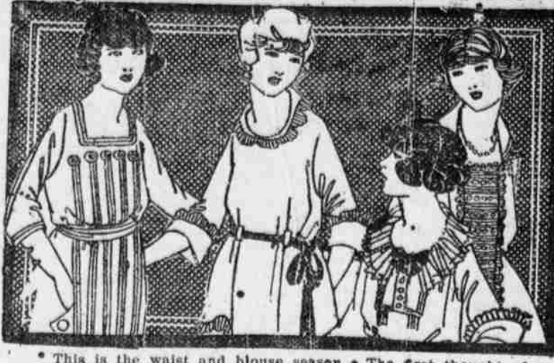
"This is the waist and blouse season." The first thought of a spring suit means that milady will want all that is new and dainty in waists to wear with it. On the left is the ever-popular salmon georgette with its bib front beaded in very attractive design. The plain georgette next to it has the semi-low roll neck, but its tunic skirt is caught gracefully with a band of velvet at the waist. The two waists at the right are in organze, the frilled collar and short yoke featuring the first while the elaborate front on the other is a panel of valenciennes lace.

The low cost of such lighting, and its reliability, due to the great development of farm electric plants during the last few years. Today the farmer can have electric service from a plant that is low in cost, reliable and remarkably simple in operation.