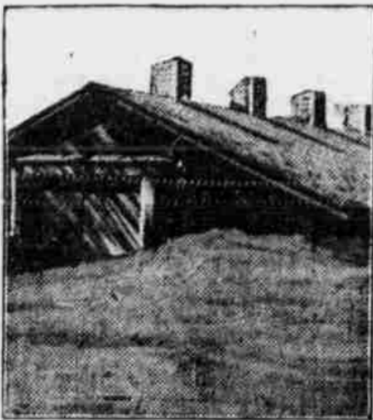
A Good Type of Potato Storage House. (Greeley Experiment Station, Greeley, Colo.)

"In the field of distribution, as well as in the field of production," says the secretary, "the farmers of the nation must assume the main tasks of