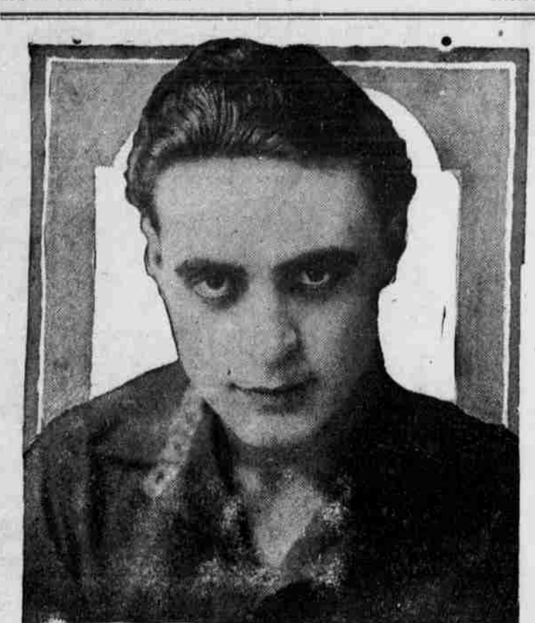
- SECTION WILLIAM ---Star in "BRAVE AND BOLD" Feature Film at Rex Theatre, August 4-5.