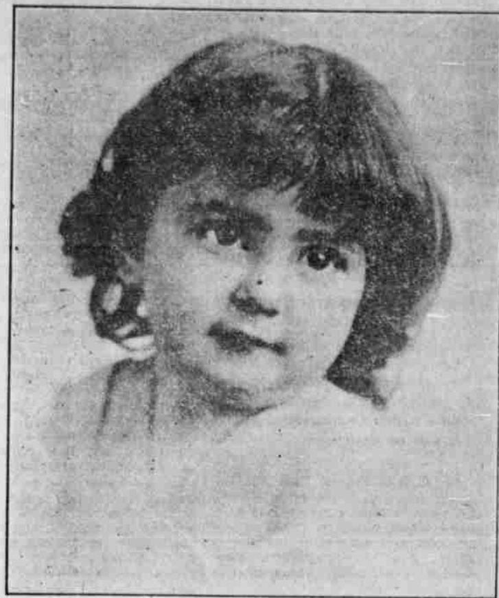
A TYPICAL ARMENIAN CHILD

Change of Address In requesting us to change the address of your paper from one post office to another it is necessary that you give the post office where you have been receiving the Enterprise as well as the new address to which you wish it sent.