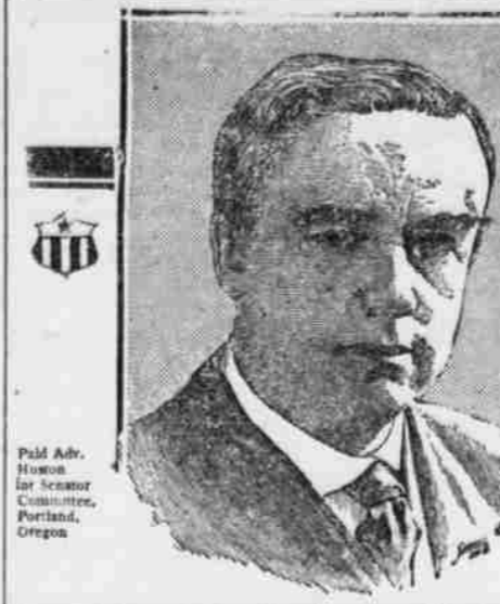
Pd Adv. House for Senator, Columbia, Oregon.

You Don't Buy TRUCKS every day be sure to ask about the White—The Vale Trading Co. can give you reliable data, telling you why the White is the Truck that will do your hardest work with the least expense. 4f.