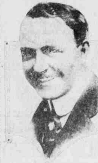
Dustin Farnum Pallas-Paramount Star