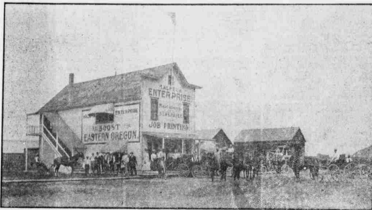
The Home of Malheur County's Leading Newspaper

An Advertisement in The Enterprise will bring results