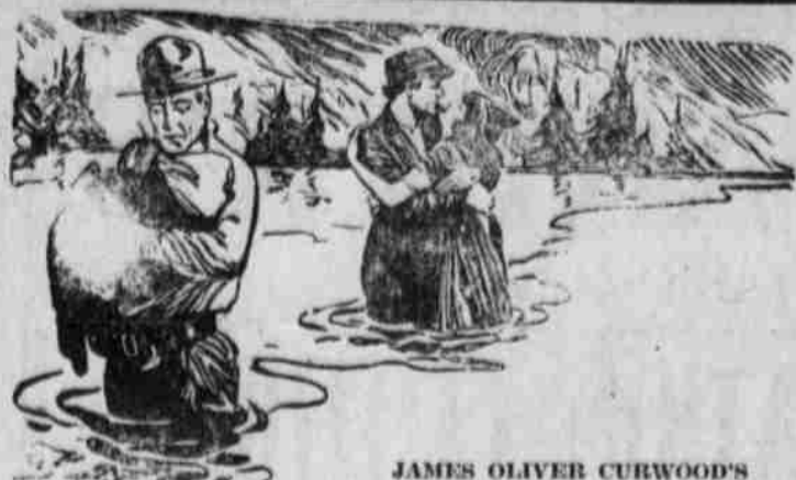
JAMES OLIVER CURWOOD'S GREATEST STORY OF NORTH- WESTERN LIFE—