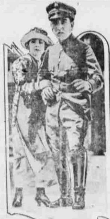
SESSUE HAYAKAWA in LI TING LANG