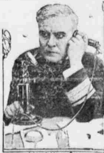
WHO'S YOUR SERVANT

A few sets Harness, for sale at a bargain. McNulty & Co.