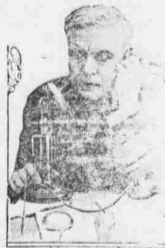
WHO'S YOUR SERVANT?