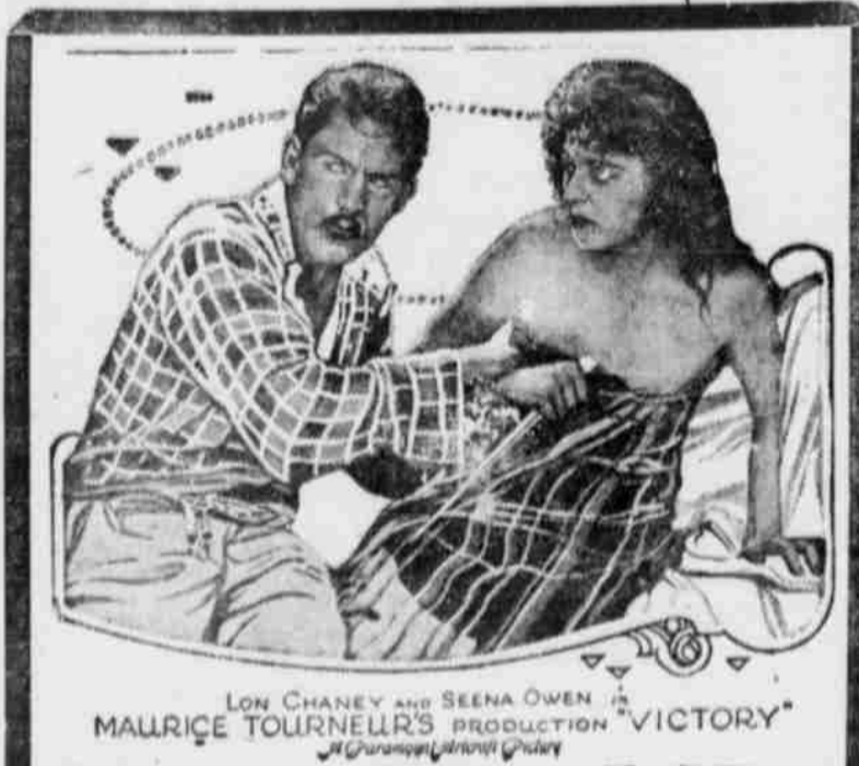
LON CHANEY and SEENA OWEN in MAURICE TOURNOUR'S PRODUCTION "VICTORY"

Love & Gold The lure of tropic isles, where nature laughs and homeless rakes woo fortune. A dirty port on a sunny sea where rogues have drifted seeking loot.