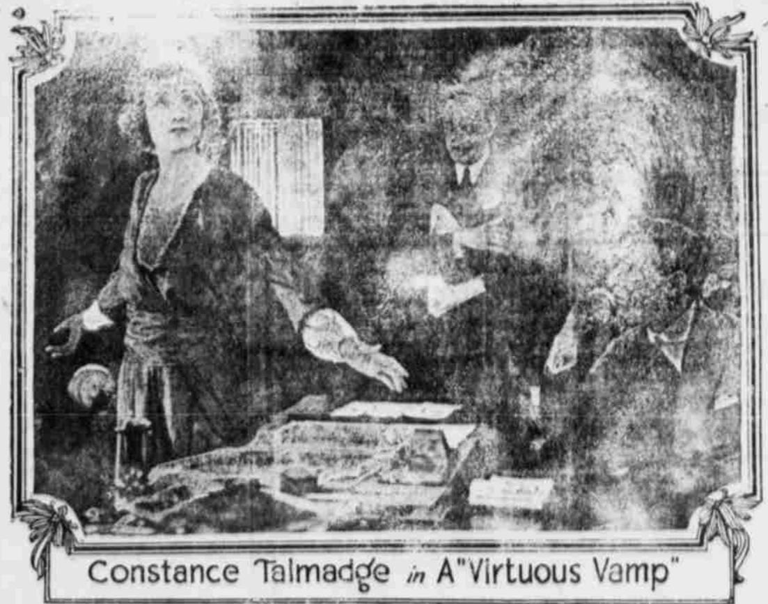
Constance Talmadge in "A Virtuous Vamp"

Tuesday and Wednesday May 18th and 19th Dreamland