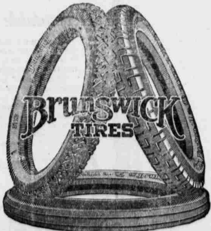
Cord Tires with "Driving" and "Swastika" Skid-Not Treads Fabric Tires in "Plain," "Ribbed" and "BBC" Skid-Not Treads

Sold On An Unlimited Mileage Guarantee Basis