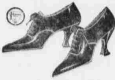
Style 312 $12.00 Widths AAA to D and Sizes 2 1/2 to 8.

GREAT care is necessary in selecting footwear just the same as selecting a gown or hat. Ashabby or ill-fitting shoe ruins the entire effect of an otherwise faultless attire.