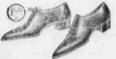
Style 324 $10.00 Widths A to D and Sizes 2 1/2 to 8.

Much shoe dissatisfaction would be eliminated if women would select footwear that has superior qualities.