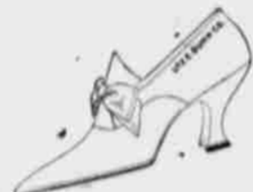
No. 320 BLACK KID $15.00