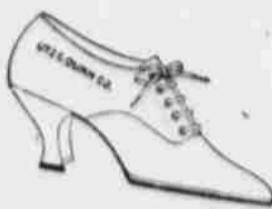
Style 364 Price $12.20

of the pretty creations in spring footwear now being displayed in our windows. They are direct from the style designers of Utz & Dunn Co., makers of "Style Shoes of Quality."