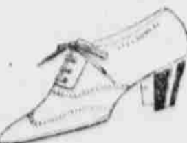
Price $14.40 Style 308

They are pleasing to look at and equally pleasing in their faultless fit and superior wearing qualities. If you appreciate stylish footwear don't fail to see our display.