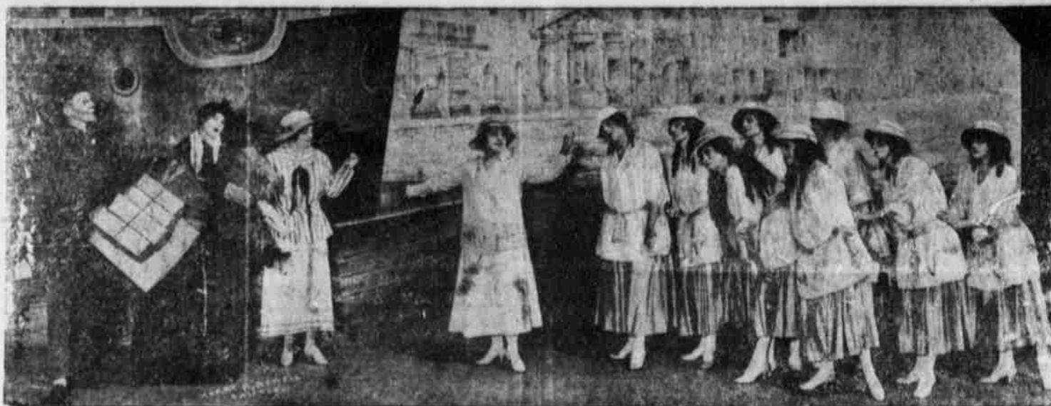
Scene from "My Honolulu Girl" coming to Dreamland Theatre, one night only, January 8