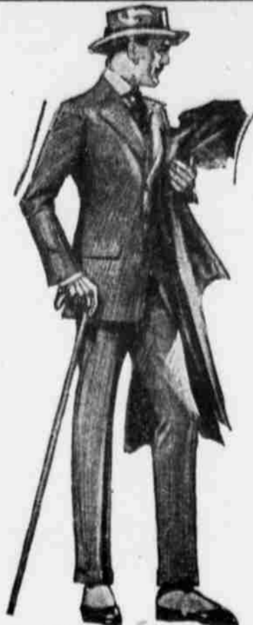
Copyright 1919, Hart Schaffner & Marx