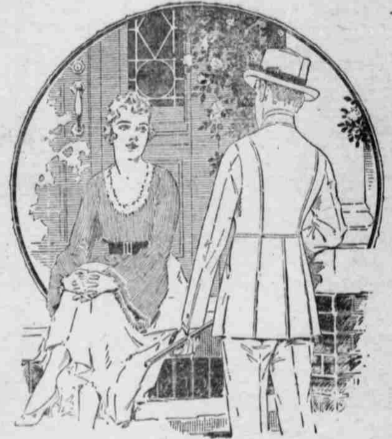
© 1919 STROUSE & BROS., INC. 24779 200

The famous Iridescent are here and also Butternut and Mahogany browns, Ivy and Pea greens, and Blue serges---all designed with the waist seam; quarter silk changeable and plaid silk lined. $23.50, $27.50, $30.00 and $32.50