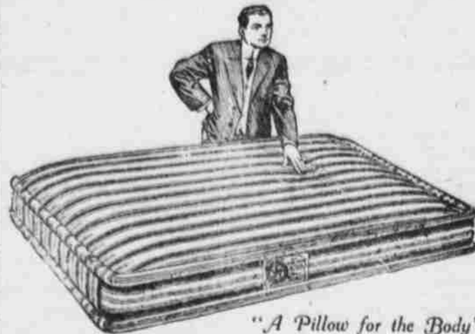
"A Pillow for the Body"

A woman whose expressions are characterized by brightness and tenderness usually possesses a mind refreshed by sufficient sleep. "Sleeplessness means not merely unrest but starvation of the cerebrum," says the scientist, R. Charles Newton. When the brain is nourished by sleep, the mind is alert and the disposition sunny.