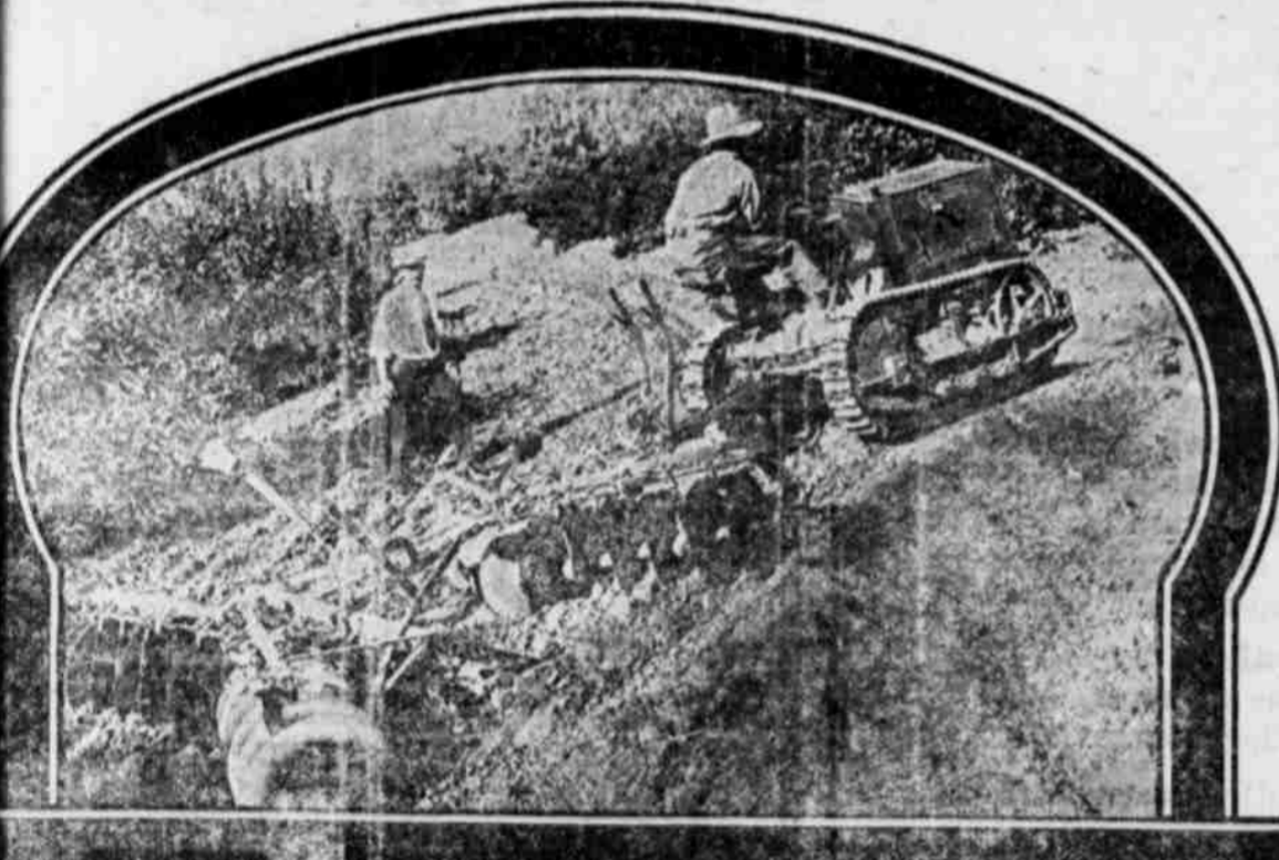
Cleveland Tractor with tandem disks working on 20 per cent grade.