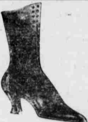
All Kid Lace or Button Shoes, light or heavy soles, LXV heels. Values to $7.00. Specially priced for this sale at $3.85