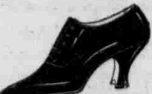
The new LXV oxford for spring, just in by express, bought to sell for $7.50. Special for this sale at $5.85