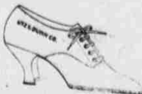
Style No. 361 Tan French Kid, welt sole.