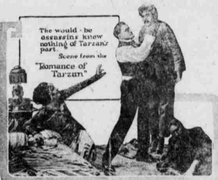
The would-be assassins knew nothing of Tarzan's part.