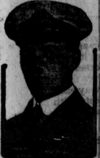
Prince Axel of Denmark, commander of the Danish navy, who is making a tour of the naval staff in America.

Greek Troops Occupy Macedonia. Saloniki.—Greek troops completed the reconquest of the regions of Greek Macedonia which have been held by the Bulgarians and Turks.