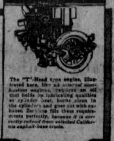
The "T"-Head type engine, illustrated here, like all internal combustion engines, requires an oil that holds its lubricating qualities at cylinder heat, burns clean in the cylinders and goes out with exhaust. Zerolene fits these requirements perfectly, because it is correctly refined from selected California asphalt-base crudes.

Experts Say ZEROLENE IS BETTER —because it holds better compression, gives better protection to the moving parts and deposits less carbon. Zerolene is the correct oil for all types of automobile engines—the correct oil for your automobile. Get our Lubrication Chart showing the correct consistency for your car. STANDARD OIL COMPANY (California)