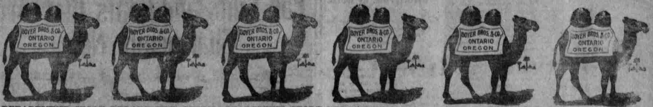
DEPARTMENT STORE DEPARTMENT STORE DEPARTMENT STORE DEPARTMENT STORE DEPARTMENT STORE DEPARTMENT STORE

Ready today at Boyer's from tip to toe, everything for every age, for our Misses and Ladies. New Fall Coats $10.00 to $75.00. New Fall Suits $15.00 to $50.00. New Fall Dresses $8.00 to $45.00. New Skirts $3.50 to $17.50. New Waists $2.00 to $12.00. New Millinery $2.50 to $15.00. New Gloves $1.50 to $3.50. New Hosiery, New Shoes, New Bags, New Dress Goods by the yard. Also everything for the Men, everything for the Boys. You are invited to make our store your down-town headquarters while attending the Malheur County Fair.