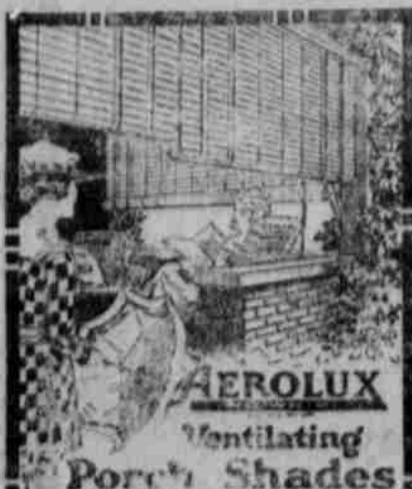
AEROLUX Ventilating Porch Shades

Special Prices to Clean up our Refrigerator Stock