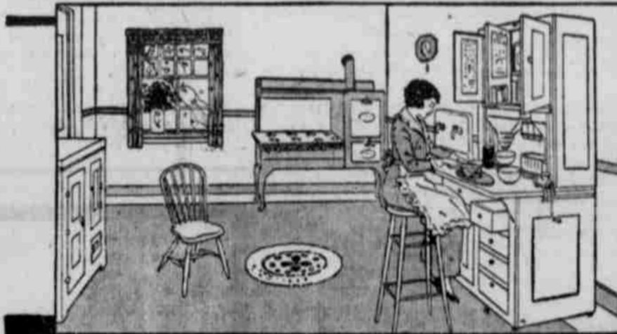
Hoosier Cabinets Save Walking 2 Miles a Day