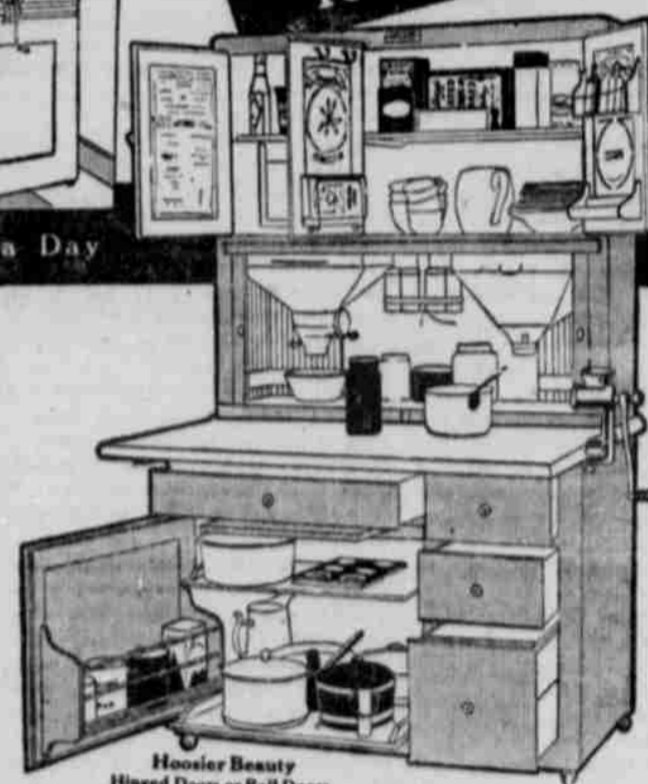
Hoosier Beauty Hinged Doors or Roll Doors

Come early—be one of the lucky "thirty."