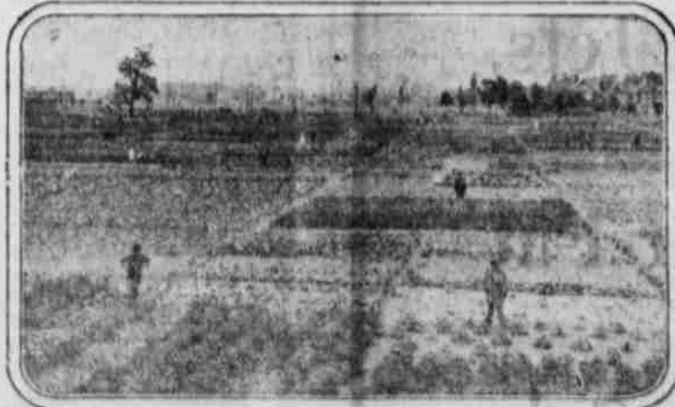
This is the War Garden Planted by Workers in a Boise Plant

HELPING to increase our export food stocks, war gardens will be planted this year in greater numbers than ever before. Each American family that has a garden plot is being urged to become more nearly self-sustaining by making use of it. This will render a national service by lessening the burdens on our railroads. Fewer carloads of food hauled about the country means more cars of munitions and food sent to seaboard for the Allies.