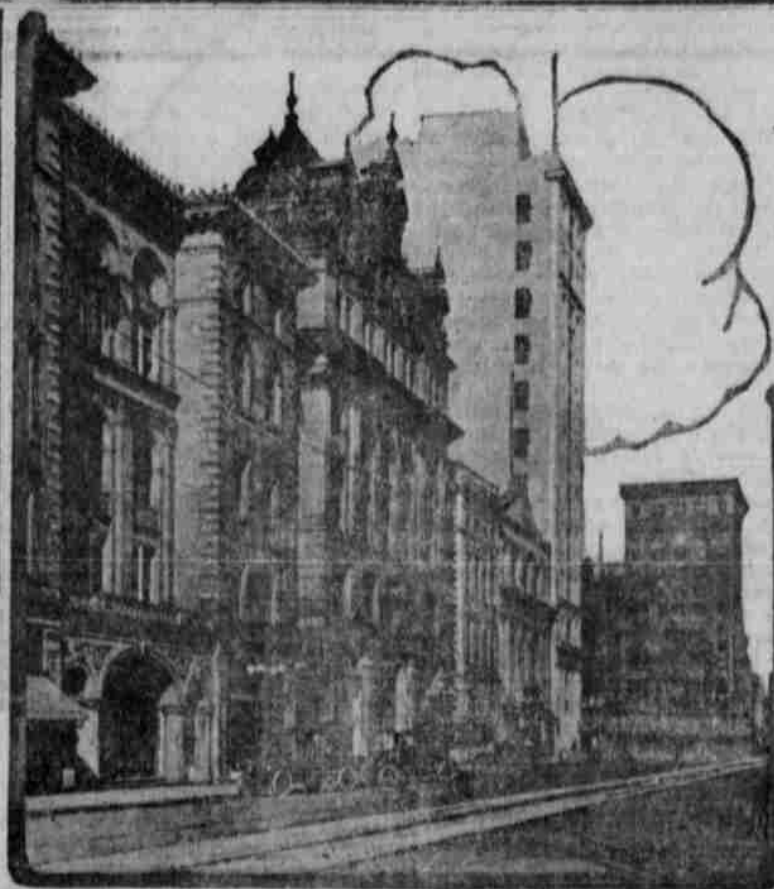
SOUTH TRYON STREET, CHARLOTTE, N. C. The "Wall Street" of Charlotte

Skyrockets Before Gunpowder. It matters very little in the long run to the small boy when, how or where fireworks were first made and of what they are made now. But the fact remains that the despised heathen Chinese first made them and used them and that civilized communities did not know of them until the fourteenth century. The skyrocket was first invented, toward the close of the ninth century and at that time was used, so it is said, in India and China in war. That was long before the invention of gunpowder.