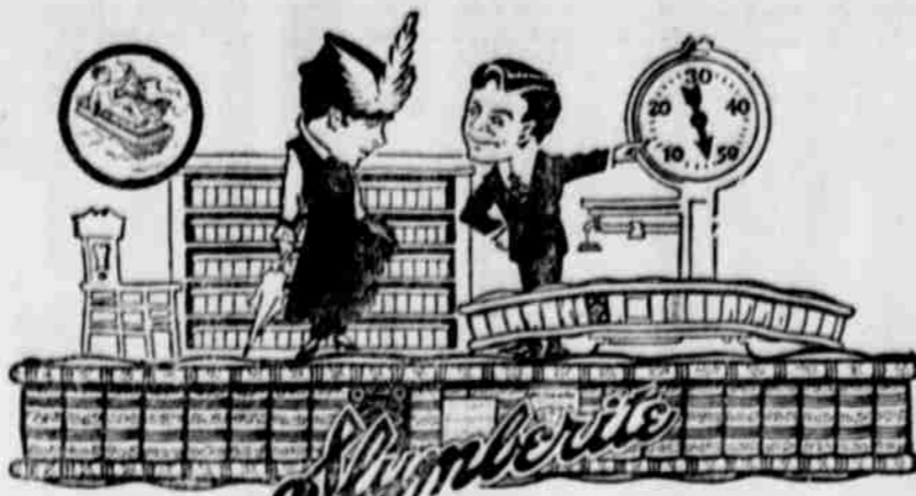
SLUMBERITE MATTRESS YEARS OF COMFORT

Made of all new clean and sanitary wool fibre, covered top, bottom and sides with a heavy layer of cotton felt (not wool rags). It is very closely tufted with a good art tick. Regular price will have to be $6.00. For a few days we will sell it at.....$4.85