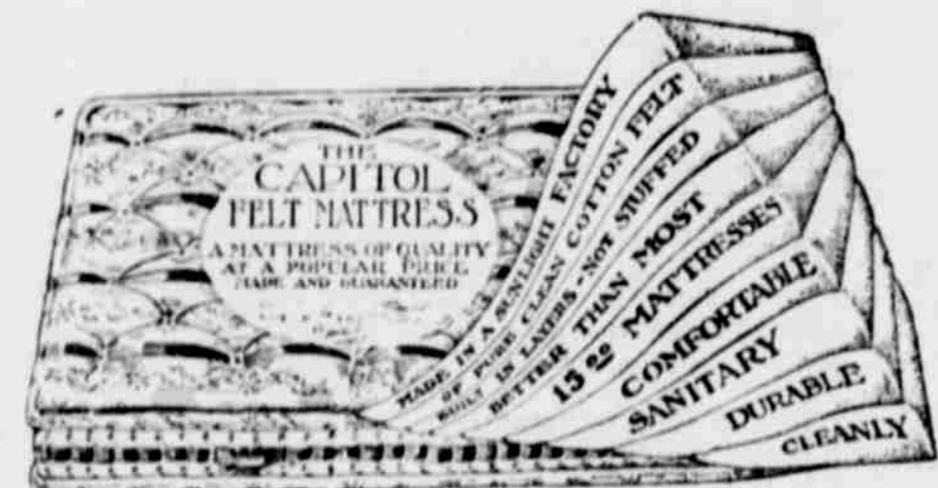
THE CAPITAL FELT

There is over fifty Sealys used in Ontario, and every user is a booster. Guaranteed for twenty years, and to be the most comfortable mattress you ever slept on. Price $24.50. We will sell them for a few days at the old price of.....$22.00