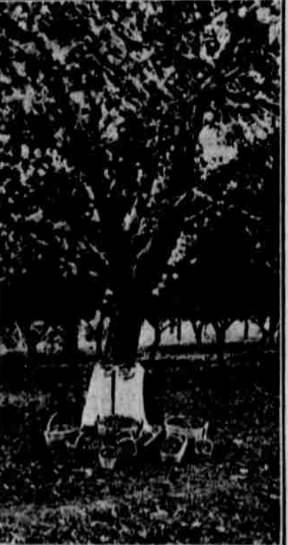
PERSIAN WALNUT TREE

The advantage of nut raising over other forms of recreation or business at the present time rests in the fact