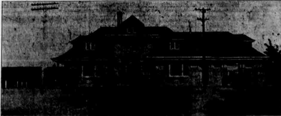
O. S. L. Depot in Ontario