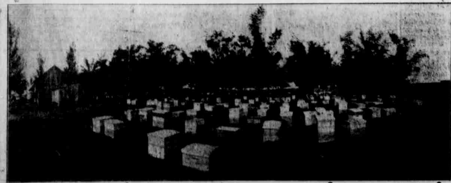
Bee Culture is a Profitable Industry