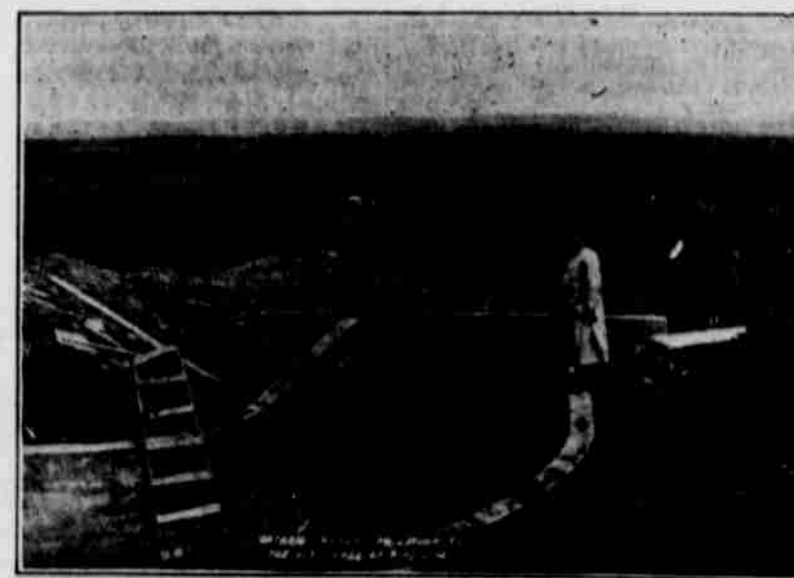
Scene on Ontario-Nyssa Ditch