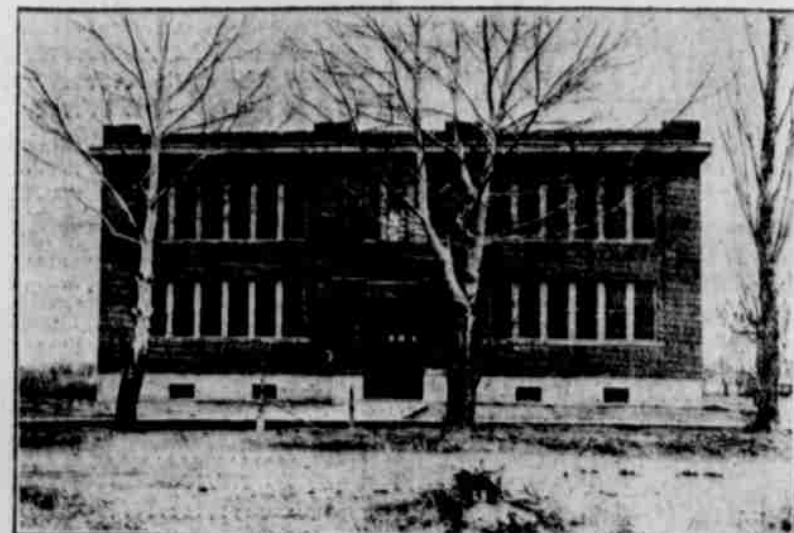
East Side School in Ontario