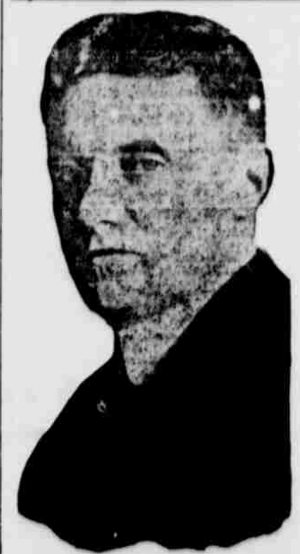
6 Mt. Charles S. Whitman, Republican Candidate, elected Governor of New